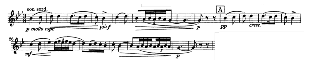
Con sord = with mute

Danse Arabe m. 14-m. 32 Target Tempo: eighth note = 96